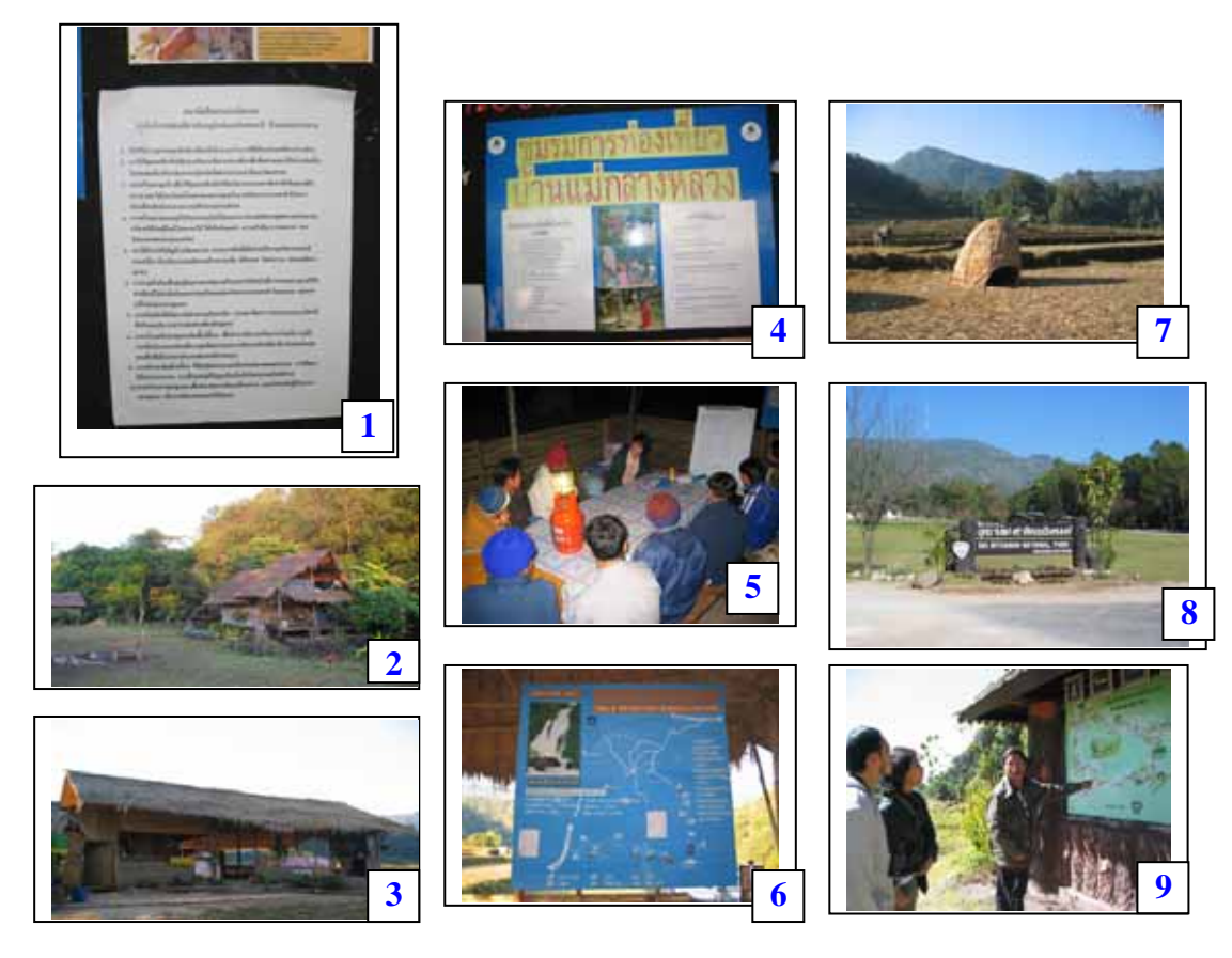
1, 2, 3, 4, 6, 7, 8, 9 5